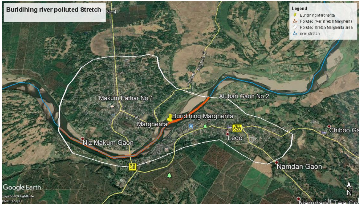
Fig 1: Map showing the polluted river stretch of Burhi Dihing River at Margherita

The length of the polluted stretch of Burhi Dihing river at intake point of OIL Duliajan and near Duliajan at D/S of Tinsukia is about 0.9 km with an area of 25 sq.km. (Fig 2) and the identified polluted stretch is from Merbil Majuli No 1 to Dihing Kinar Badhari.