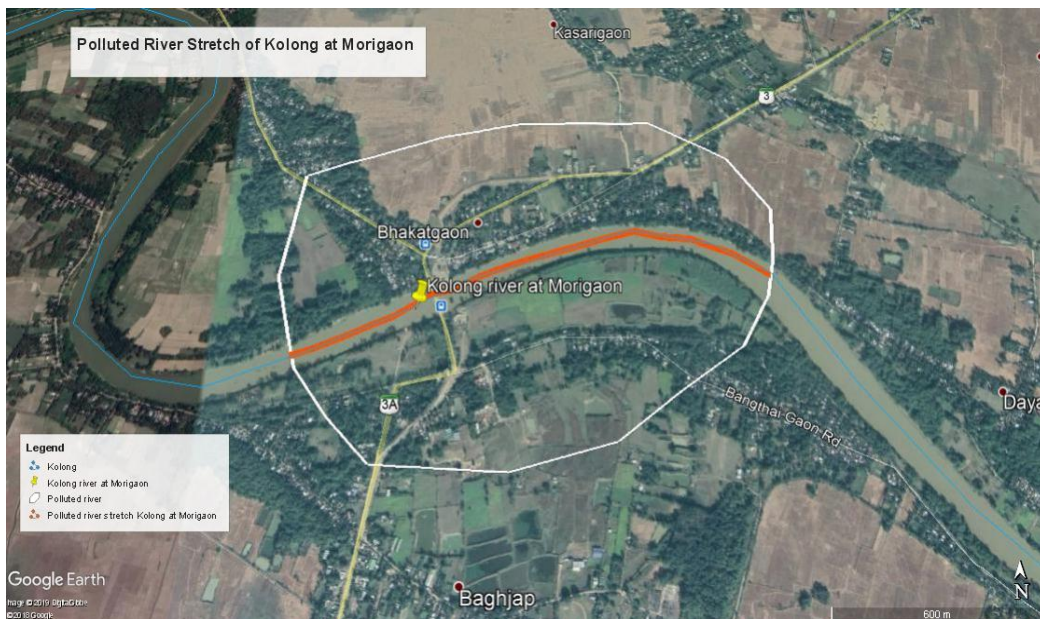
Fig 2: Map showing the polluted river stretch of Kolongriver at Morigaon

The length of the polluted stretch of Kolongriver at Morigaon is about 1.5 km with an area of 2.0 sq.km.(Fig 2) and the identified polluted stretch is from Bangthaigaon road to Baghjap