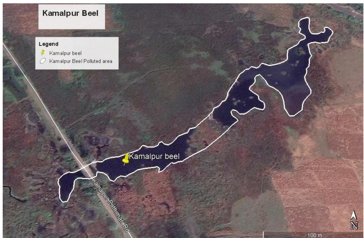
Fig 1: Map showing the Kamalpur Polluted wetland

The wetland is having a length of 1.16 kms with an average area of 11624 sq. meters